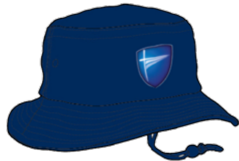
With sports uniform only.