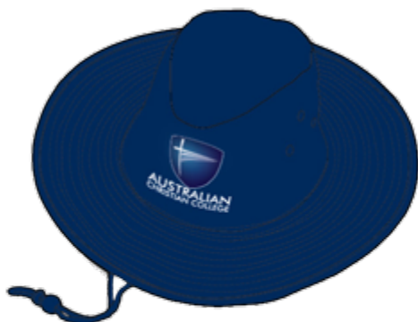
Slouch hat to be worn with dress uniform and sports uniform.